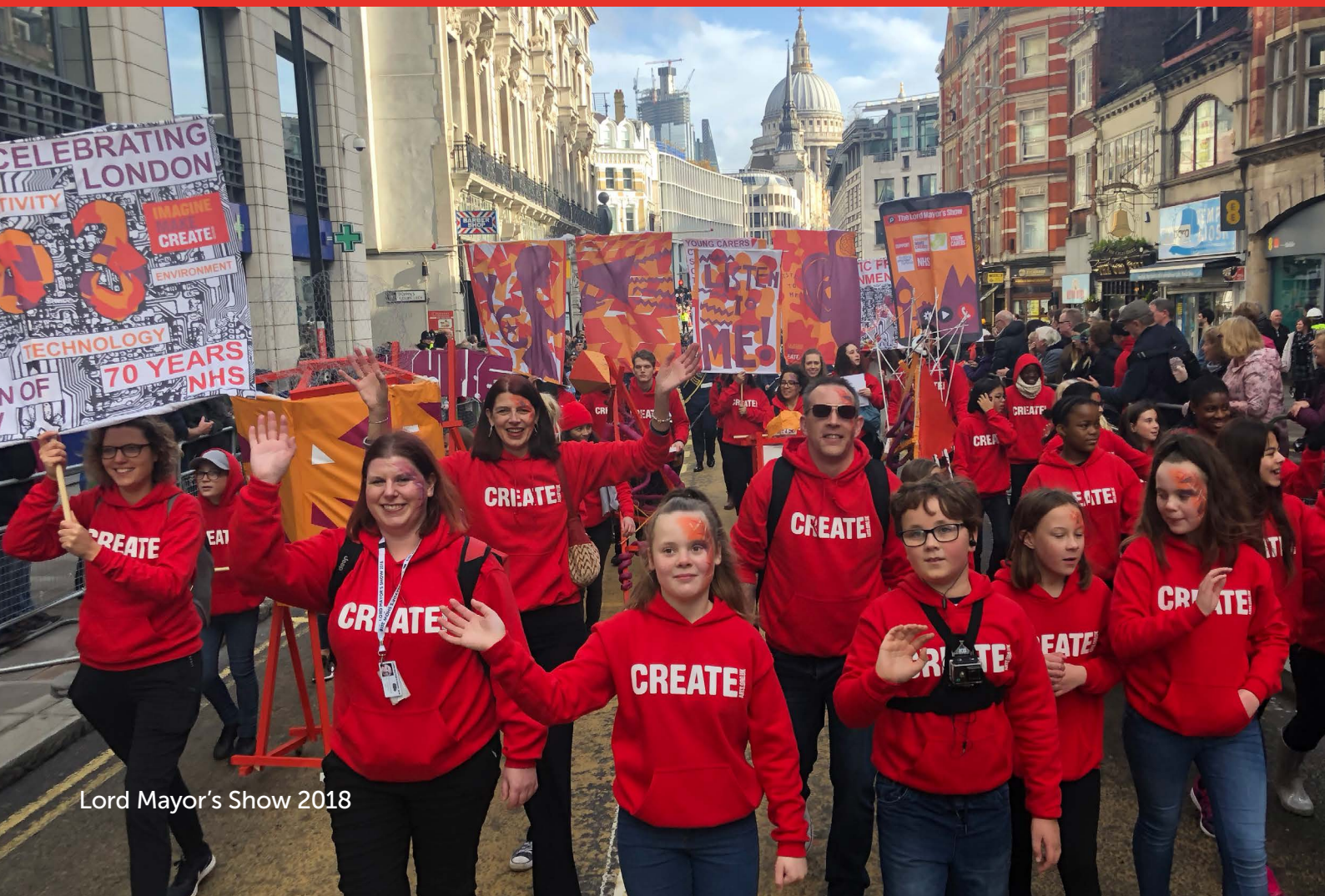
Lord Mayor's Show 2018

This is a hugely exciting time to join Create as we aim to double our reach and income by 2028, and expand our North West hub based in Manchester. To make this vision a reality, we are recruiting professional artists based in the North West (in/around Greater Manchester/ Merseyside) to run creative arts projects in the region and become part of our artist pool.