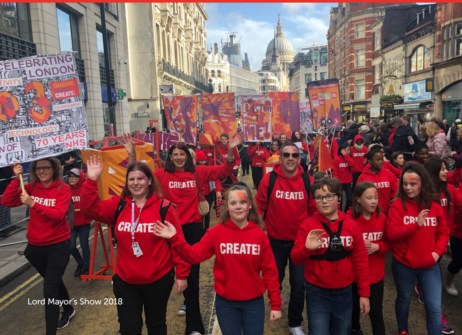
Lord Mayor's Show 2018

This is a hugely exciting time to join Create as we aim to double our reach and income by 2028, and continue expanding our work in the North West.